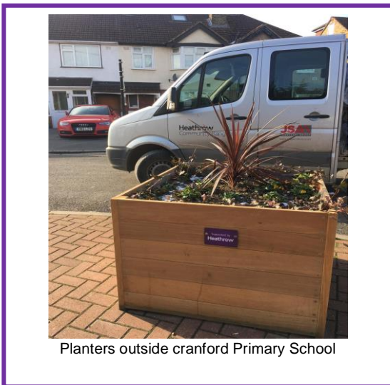
Planters outside cranford Primary School

They have also provided hands on support in the restoration of the much-loved Cranford Memorial Garden. The bulbs that the team planted earlier in the year are now flowering, and the railings have been sanded and painted to bring a new lease of life to them. We are now working with Cranford Primary, whereby the children are designing posters, which will feature on the outside of the planters that the rangers have recently maintained near the school.