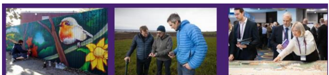
HEATHROW COMMUNITY FORUMS REVIEW CONSULTATION FEEDBACK SUMMARY REPORT

This has included a 4-week consultation from 13 th January- 12 th February in which we asked stakeholders to feedback on our current engagement channels. This feedback has been summarized in our Community forums review consultation feedback summary document .