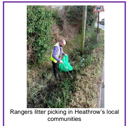
Rangers litter picking in Heathrow's local communities

Heathrow has partnered up with the Heathrow Community Trust, to donate 10,000 books to our 5 local primary schools. Each of Colnbrook Primary, Pippins Primary, William Byrd Primary Academy, Harmondsworth Primary and Heathrow Primary have received 2,000 fiction books to help children find their love of reading. The donation was made via the Ilhezio Foundation, a non-profit organisation which redistributes books from UK book sellers to primary schools in the UK, Sierra Leone, Nigeria and Liberia. We hope the donation helps to enrich pupils learning as they are welcomed back to school.